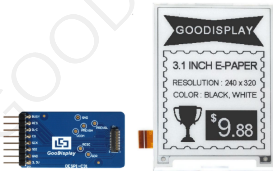
Figure 2 : Connection of E-paper display and Adapter

Note: This connector is a rear lock type. When using it, you need to stand up the switch first, insert the E-paper display and then press the switch to lock it.